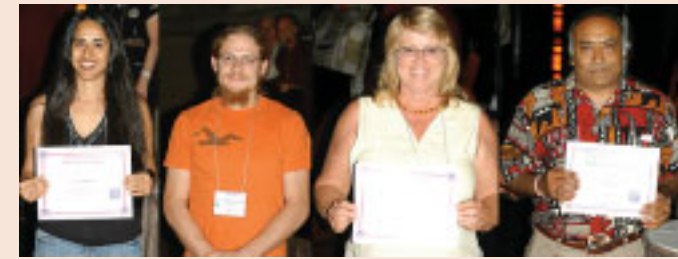
Recent ACVA Online Graduates

We at the American College of Vedic Astrology realize that in order to become successful, one must have the backing of a community of experienced and supportive teaching staff, graduates and fellow students.