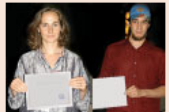
Recent ACVA Certification Graduates

The American College of Vedic Astrology offers a flexible certification program. When students complete 600 hours of study, they gain eligibility to sit for the ACVA examination. For the ACVA Level I examination the Level I course online provides 600 credit hours toward this 600 hour requirement.